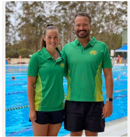
Club Shirt & Shorts $35 each