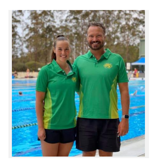
Club Shirt & Shorts $35 each

"Swimming – the only sport with no hack times, no substitutions, no timeouts. You only get one shot for your goal"